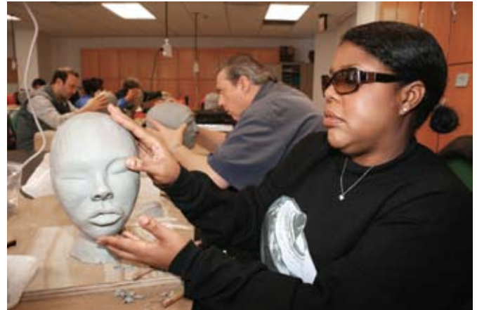
Clay and wax modeling assist Mortuary Science students in learning facial restoration techniques.