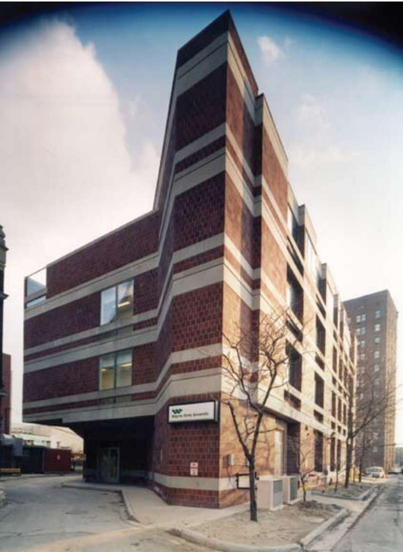
The Mortuary Science building was renovated from a state psychiatric hospital into a facility offering the most advanced teaching and research resources.

FAS programs continued from page 1 . . .