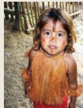
This young Amazon native is a member of the Yagua Indians.